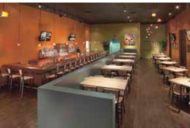
Premiers Restaurant inside the theatre.