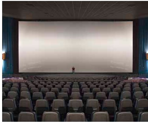
Wow, think this is big? Check out the theater attendant standing at the base of the screen!