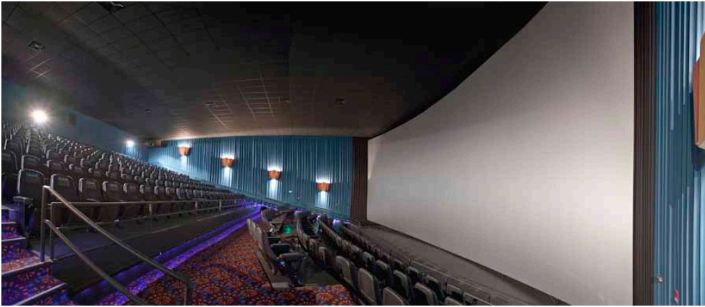
Entering the new IMAX, this is big!